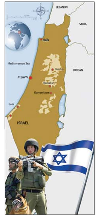
Jewish Land Palestinian Land

Today, in the so-called country Yisra'el, they pronounce the name Joshua as "Yehshua". Remember, we are talking about a nation that has been established by the crown, Great Britain, and its side kick, the United States of America. It was these two countries who in 1948, under the "League of Nations", chose to take a group of people calling themselves Jews, the "Ashkenazi" descendants from the land of the "Khazars" in Southern Russia. This land extended from the Caspian Sea to the Black Sea, as far as Crimea. They are natives of the Caucasus Mountains. They are Gentiles. I would like to inform you that this information is not new, but an old affidavit that has been systematically kept from the public, especially by Messianic groups. Their perception is modernly appealing because we live in a world ruled by the European gentiles, but this deception merely rest upon an assumption. The real tragedy is that we have been trained to manipulate our minds to exclude truth from our conscience. We must hear from a Yah-sent Pastor.